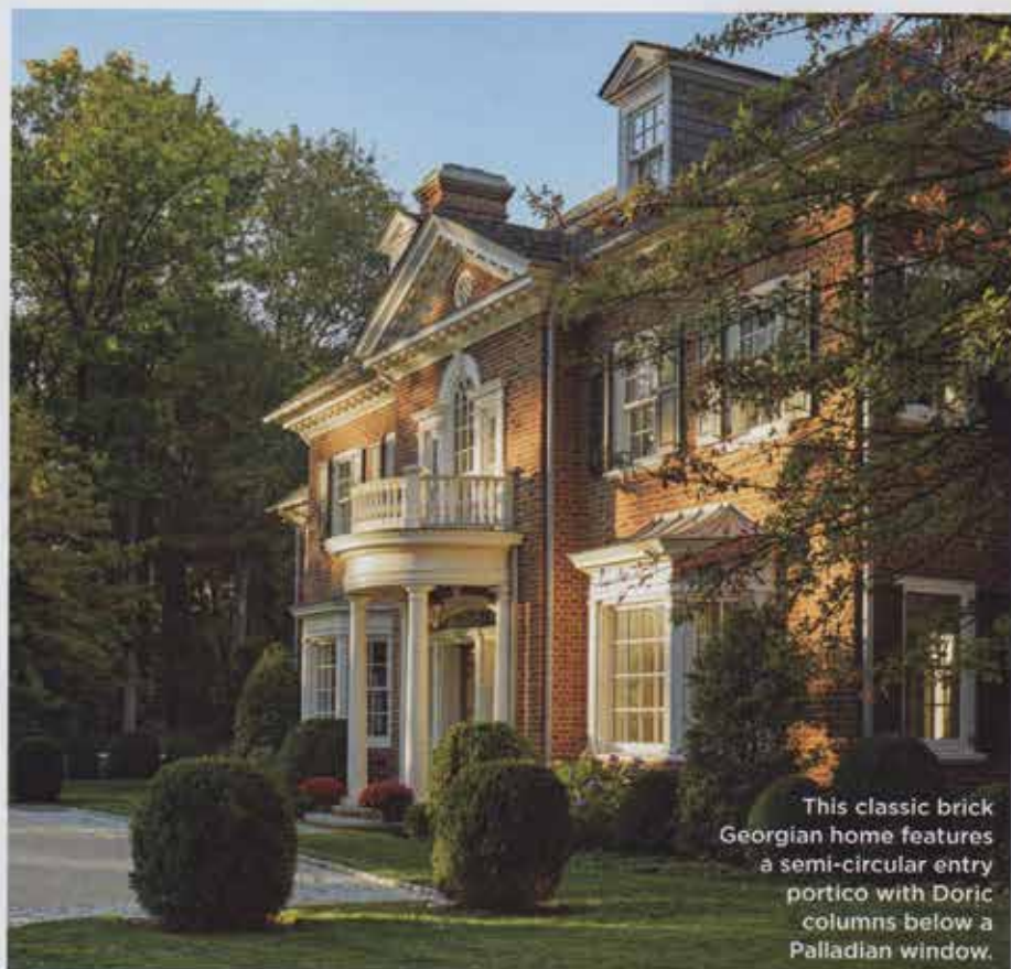
This classic brick Georgian home features a semi-circular entry portico with Doric columns below a Palladian window.